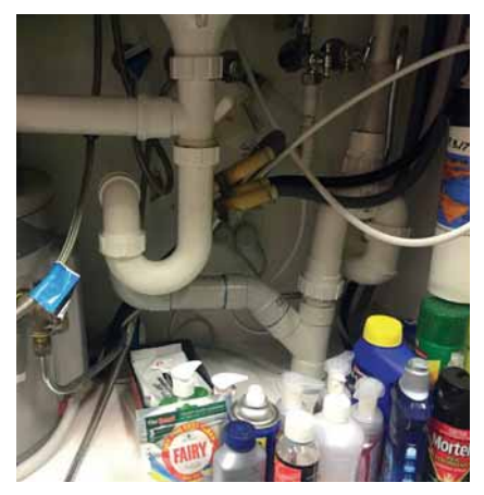
Common household cleaners stored under kitchen or bathroom sinks where flexible braided hoses are installed can create fume cupboard environments that corrode the braided stainless steel sleeve, leading to bursting hoses.

According to Trevor, this can cause the rubber seal to react by compressing over time and forming a permanent stress.