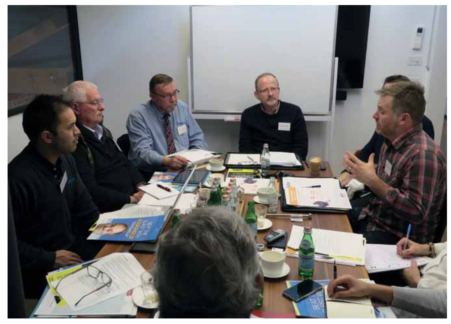
In July Plumbing Connection hosted a workshop with industry stakeholders to discuss the issue of bursting flexible braided hoses.

Flexible hoses are very versatile and significantly reduce the time it takes to hook-up hot and cold water pipe appliances, such as taps, dishwashers and water heaters. They also overcome alignment problems and significantly reduce labour costs and noise in pipe work, as well as eliminate brazing, welding, cutting, re-shaping and waste.